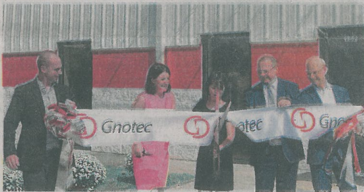
SPECIAL TO THE T&D

Gnotec will use the facility initially for warehousing and then manufacturing operations focused on welding and product